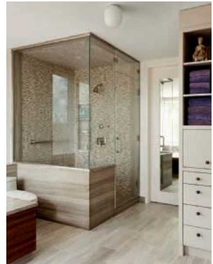
THE SHOWER STALL is lined with marble tiles. The mirrored door leads to the wife's dressing room. The vanity (TOP) is framed by lacquered storage cabinets and is illuminated by vertical sconces, backlighting within the mirror, and fluorescent lighting in the soffit.