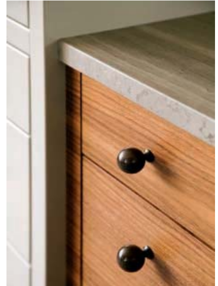
MEICHI PENG INCORPORATED some of the owner's favorite elements into the design such as the Dornbracht faucet set (TOP) and the spherical oil-rubbed bronze knobs used on the walnut vanity (ABOVE) and the drawers in the lacquered storage towers.