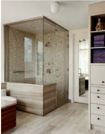
THE SHOWER STALL is lined with marble tiles. The mirrored door leads to the wife's dressing room. The vanity (TOP) is framed by lacquered storage cabinets and is illuminated by vertical sconces, backlighting within the mirror, and fluorescent lighting in the soffit.